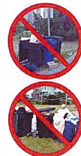
no overflow of trash or recycle